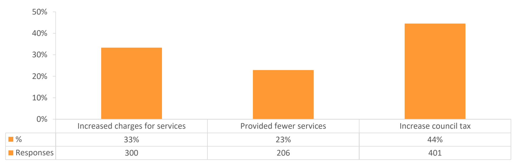
Council Tax To accelerate recovery and balance the budget, would you rather we; Please select all that apply